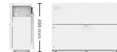
240 mm | 726 mm | 496 mm