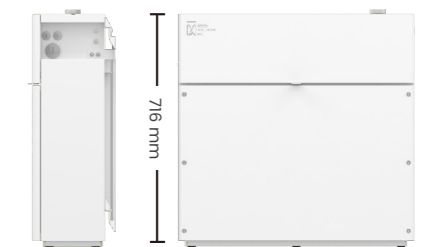
240 mm | 726 mm | 716 mm